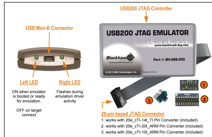
FIGURE 1 - USB200 JTAG Emulator (multiple views)